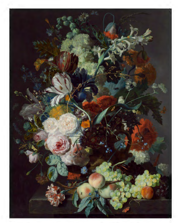
FIGURE 0.10 Jan van Huysum, Still Life with Flowers and Fruit , c. 1715, oil on canvas. PUBLIC DOMAIN, COURTESY OF THE NATIONAL GALLERY OF ART, WASHINGTON DC.

Fruit and vegetable themed still-lifes worked in very similar ways. Like flowers, fruits inscribed the passing of time and seasons, and with that, the desire to preserve beauty and prosperity indefinitely. Caravaggio's Basket of Fruit from 1599 was an influential and yet very unusual instance of fruit still life in which insect-nibbled fruits and blemished leaves tipped the utopian harmony of the classic stilllife towards new philosophical and aesthetic notions of problematized realism. In this painting, the inevitability of death is embraced as part of a harmonious cycle of life and death. And as with the flower still-life genre, fruits appear as place-markers of religious symbolism. Amongst others, lemons symbolized the Virgin Mary, pomegranates resurrection, apples symbolized temptation and the original sin, and figs fertility.