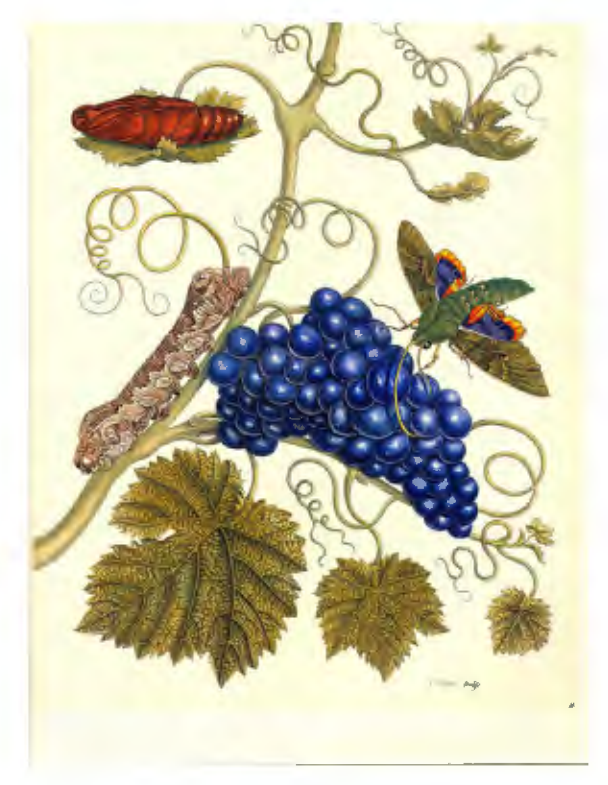
FIGURE 0.7 Maria Sibylla Merian, from Metamorphosis Insectorum Surinamensium, 1705.

Galen. Its innovative aspect lied in the inclusion of more than five hundred woodcuts proposing the classical iconography of natural history representation, featuring a singled out plant, usually uprooted, (so that the root system could be seen) and flattened against a plain background. This new iconographic standard was the result of the previous representational strategies of Italian natural history, the cataloging work of Ghini and Cibo, and an integration of the artistic dexterity of three artists who produced the plates for Fuchs: Albrecht Meyer, Heinrich Fullmaurer, and Veit Rudolf Speckle.