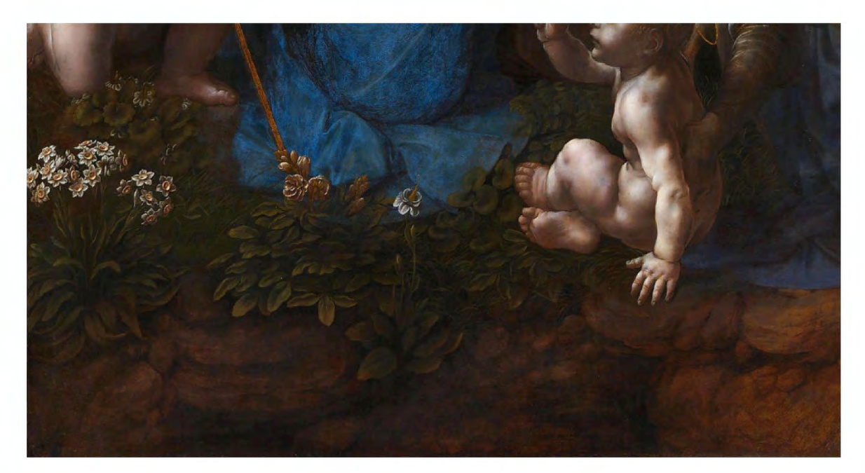
FIGURE 0.4 Leonardo da Vinci, Virgin of the Rocks (detail), National Gallery, London. About 1491/2–9 and 1506–8. PUBLIC DOMAIN.