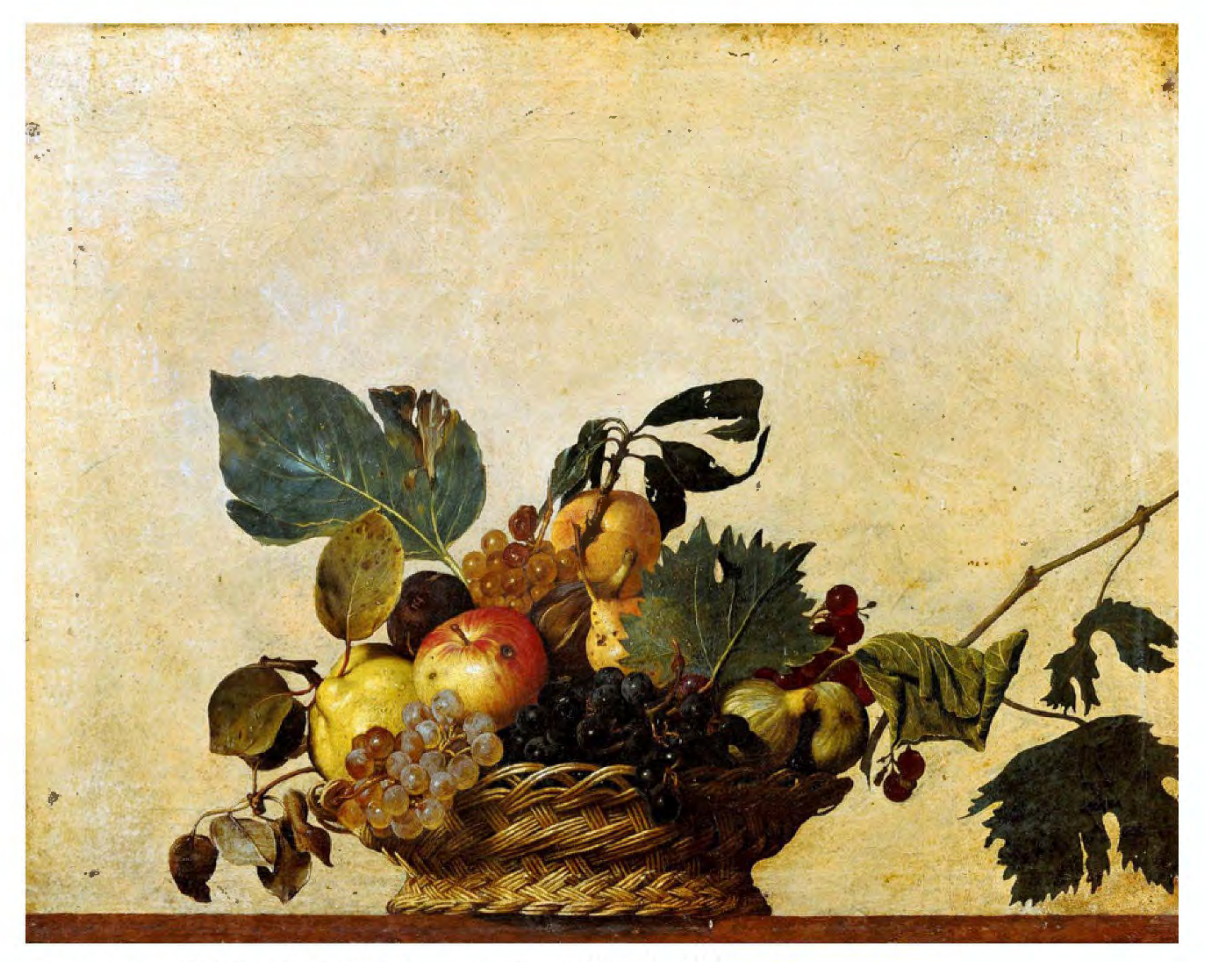
FIGURE 0.11 Michelangelo Merisi da Caravaggio, Canestra di Frutta, 1599.

One of the main purposes of Western classical painting was that of objectifying the world to affirm the power of the viewer over it. It is possible to identify a gradation of objectifying parameters in which women and nonwhite humans, for instance, are more regularly objectified than white men, and in which animals and plants are more closely aligned to the registers of objectification reserved for the human-made, than the living. It is for this reason that the representation of flowers and fruits in art is always ambiguously suspended in a symbolic realm of objectification that transfigures the nonhuman into a metaphorical vessel for the human. What's left in the wake of this process is a relative form of interest for the natural in which we only seem to have two alternatives: the scientific objectification and the metaphorical objectification.