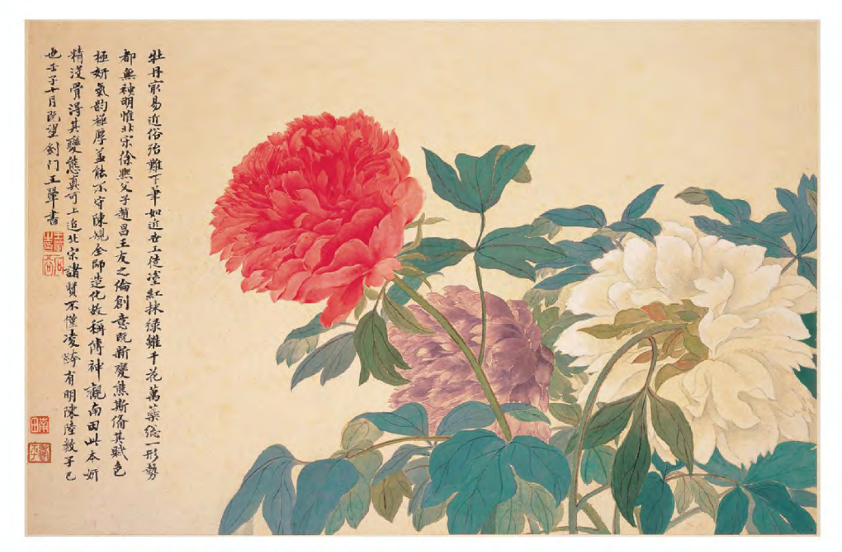
FIGURE 0.9 Yun Shouping, Peonies , 17th century. PUBLISHED IN THE U.S. BEFORE 1923 AND PUBLIC DOMAIN.