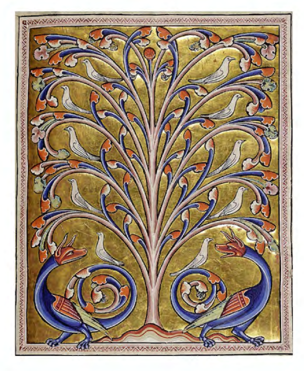
FIGURE 0.1 The Tree Peridexion in Oxford Bestiary, c. 1220.

Thereafter, the formula of the Physiologus became the blueprint of the Bestiarium—a zoologicalepistemological site that profoundly marked Medieval and Renaissance culture in Europe. The Latin text of the surviving early bestiaries effectively is a translation of the Physiologus.30 However, most importantly, moving beyond the Physiologus' unorganized assemblage of information, the Bestiarium provided more visual representations, first unclassified (before the twelfth century) and thereafter classified in loose orders.