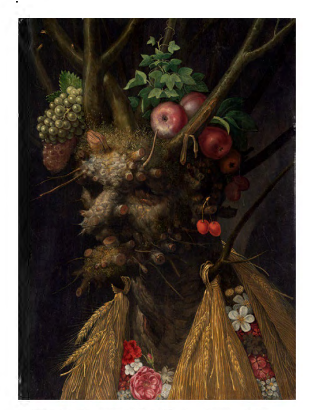
FIGURE 0.6 Giuseppe Arcimboldo, Four Seasons in One Head , c. 1590, oil on panel. Paul Mellon Fund COURTESY OF THE NATIONAL GALLERY OF ART, WASHINGTON DC.

Cast as vessels for entirely human affairs, plants and their flowers shared a very similar representational destiny with animals. Renaissance animal presence in art was characterized by the same symbolic trajectories defined by Medieval manuscripts and bestiaries—animals were always symbolically tamed and domesticated by representation. An emblematic example of this condition is provided by the whimsical use of plants in the late sixteenth century paintings of the Italian artist Giuseppe Arcimboldo. In some works based on the superficial notion of the "scherzo" or "capriccio," the artist produced vegetal compositions inscribing a human portrait. It has been claimed that his "composite heads" aimed to criticize rich people's conduct, and their frivolous and superficial approach to culture. The flowers and fruits represented in these paintings essentially are an attention seeking device through which purely anthropocentric concerns are expressed.