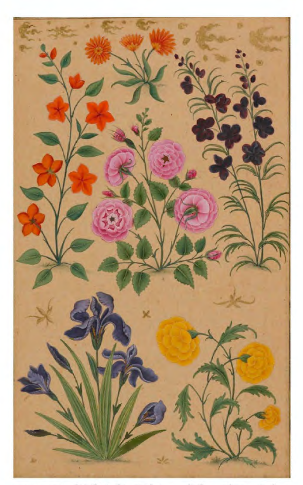
FIGURE 0.8 Attributed to Muhammad Khan, Flower studies , 1630–33. ADD.OR.3129, F.67V, PUBLIC DOMAIN.

and their enmeshing into symbolic representational dimensions, was also common. Menageries and botanical gardens became popular during the Mughal Empire between 1556 and 1862. Prior representations of animals and plants, from the 12th and 13th centuries, show the influences of the