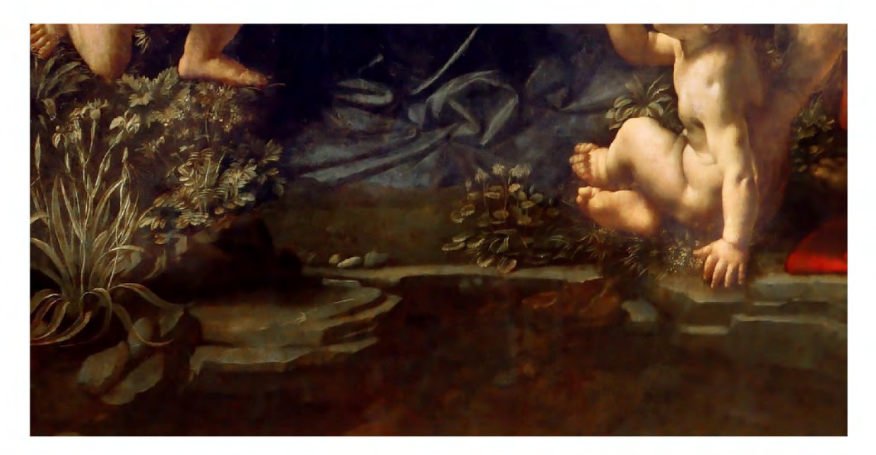
FIGURE 0.5 Leonardo da Vinci, Virgin of the Rocks (detail), The Louvre, Paris. 1483–85. PUBLIC DOMAIN.

FIGURE 0.4 Leonardo da Vinci, Virgin of the Rocks (detail), National Gallery, London. About 1491/2–9 and 1506–8. PUBLIC DOMAIN.