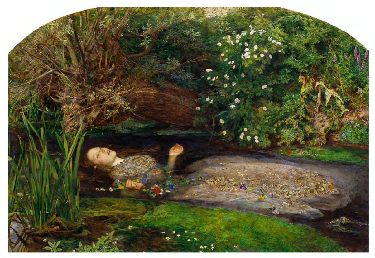
FIGURE 0.13 John Everett Millais, Ophelia, oil on canvas, 1851–52, Ophelia, Google Art Project.

Victorian excitement for new exotic forms and natural colors was complemented by the simultaneous prominence acquired by floriography. A cryptological communication through the depiction of mainly European flowers, floriography originated in France during the first half of the nineteenth century and became central to the spiritual paintings of the Pre-Raphaelites Brotherhood. Most notably, John Everett Millais's Ophelia, from 1852, successfully straddles scientific realism with the poetic demands of Shakespearean narration. The artist's determination to accurately capture each plant painted on his canvas led him to perch his easel on a precise spot on the bank of the Hogsmill River for a five month period. He allegedly spent eleven hours a day, six days a week on the bank, sometimes through adverse weather. Surprisingly, the realism of the scene clearly annoyed some critics who reprimanded the artist on his approach to vegetation. The Times' critic said: "there must be something strangely perverse in the imagination which sources Ophelia in a weedy ditch, and robs the drowning struggle of that lovelorn maiden of all pathos and beauty." Meanwhile John Ruskin reportedly took issue with the lack of idealization in the portrayal of nature. "Why the mischief should you not paint pure nature," he asked, "and not that rascally wire fenced garden rolled-nursery-maid's paradise?"