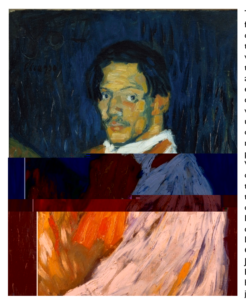
PABLO PICASSO, YO, PICASSO (SELF-PORTRAIT), PARIS, 1901. OIL ON CANVAS, 73.5 × 60.5 CM (29 × 23 7/8 INCHES). PRIVATE COLLECTION.

The bright range of hues and the freedom of paint application that characterized so many of the works that Picasso did in Paris for the show was certainly more "French" than the typically Spanish scenes of bullfights and majas that Vollard might have expected.7 Lively touches of crimsons, ochres, and viridians, as well as whites. Prussian blues, and ultramarines, animate Picasso's scenes of modern Parisian life, from street markets and race courses to children playing in the Luxembourg Gardens. While these paintings were carried out in his studio (and not outdoors), the subjects of many of them suggest that their inspiration came from direct observation. For example, in The Blond Tresses [Les Blondes chevelures], a work also known as Little Girls Dancing, which the critic Gustave Coquiot singled out in Le Journal for its "exquisite" colours, Picasso takes something he may well have actually seen-three children joined together in a wild dance-as a starting point for his composition. Although their heads are facing in different directions and they are not holding hands, each of the girls