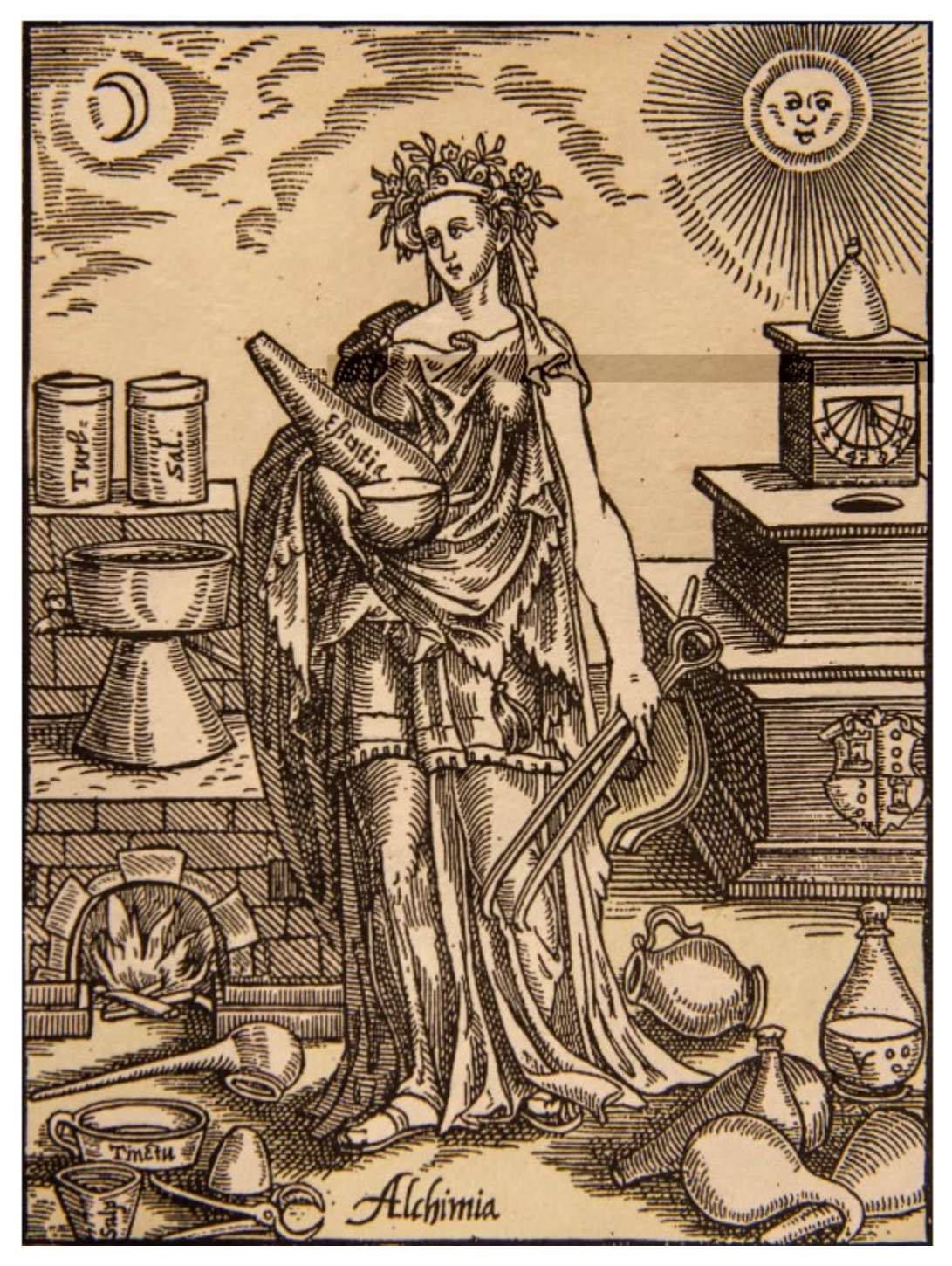
Leonhard Thurneysser, Quinta essentia (1574), fol. xxxvii

The days which follow are taken up with festivities, dinners, tours in the castle, and, most importantly, preparations for the wedding, during which the select few further demonstrate their worth. They engage in work of an alchemical nature. When six royal persons ("Königliche Personen") present at the castle