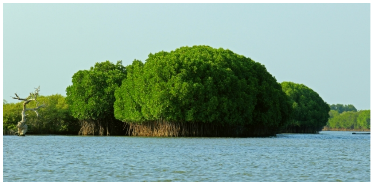
PICHAVARAM MANGROVE FORESTS IN INDIA

Trees are everywhere in our lives: in food, medicine, construction, play; in arts; in industrial materials; in the newsprint and books you read. Many rural communities around the world have special relations with trees that offer them all sorts of resources: spices, treatments for ailments; wood for fuel, building, carving, tools and weapons; with writing materials and fencing; with leaves for shade, fodder and roofing; twigs for basketry and small devices or tools. Others, like the marvellous Gao tree ( Faidherbia albida ) of Africa, are legumes, fixing nitrogen in the soil to improve fertility for other crops. Many trees that we take for granted have been overexploited, with devastating consequences for both indigenous communities who are sustained by their life-giving materials. The widespread destruction of a very precious coastal biome called mangal, consisting primarily of mangrove ( Rhizophora spp.) exacerbated the devastating effects of the December 2005 tsunami. Where did all those mangrove trees go? Primarily to make charcoal for your garden barbecue; and to allow for fish farms. Deforestation, climate change and indigenous cultures are umbilically linked.