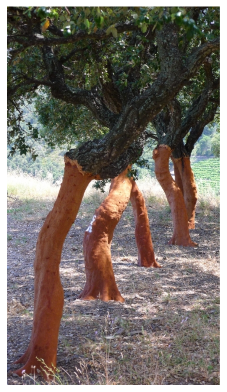
CORK OAKS FROM NORTHERN SPAIN

At the weekend, why not indulge in pancakes with syrup (Acer saccharum) or even chocolate sauce ( Cacao theobroma ). You might be resting your cereal bowl on a mat made of cork ( Quercus suber )—the remarkably self-replenishing bark of an evergreen Mediterranean oak.