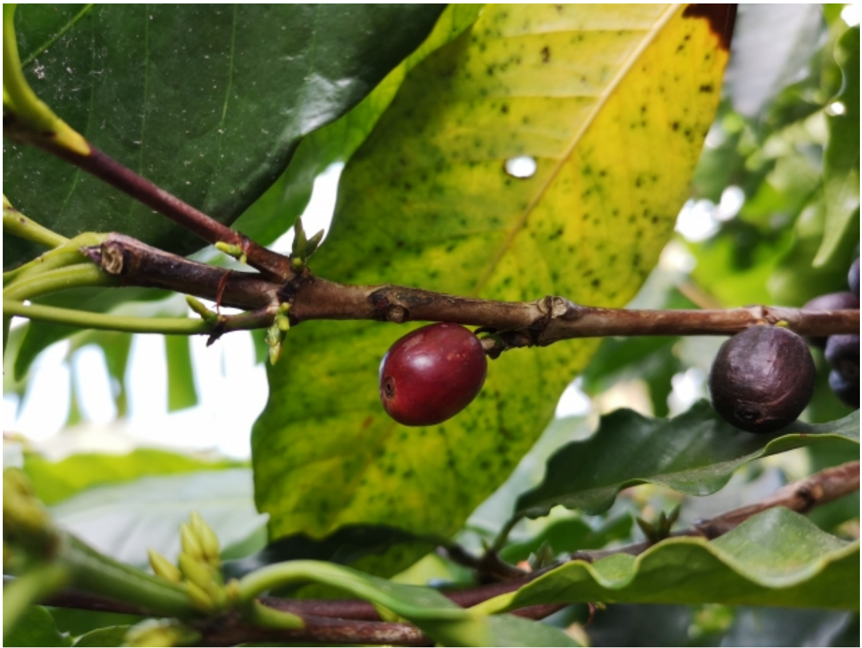
A RIPE COFFEE ARABICA CHERRY