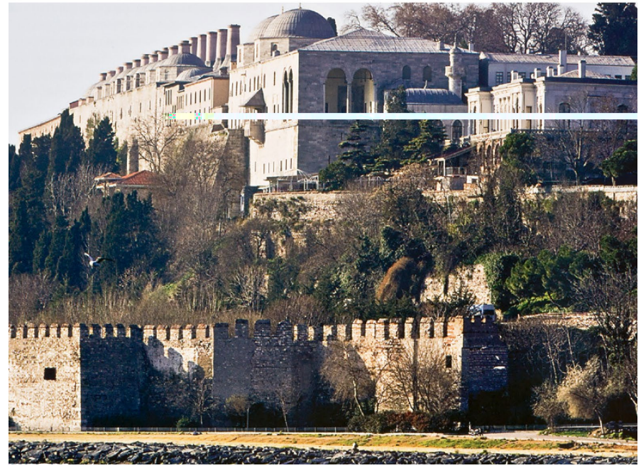
FIGURES. IA-B. THE TOPKAPI PALACE IN ISTANBUL. [IA] VIEW FROM THE MARMARA SEA, WITH THE INNER TREASURY (TREASURY-BATH COMPLEX). (PHOTO: GÜLRU NECIPOĞLU) [IB] CLOSE-UP VIEW OF THE INNER TREASURY (TREASURY-BATH COMPLEX). (PHOTO: DOĞAN KUBAN, OTTOMAN ARCHITECT

Realizing that MS Török F. 59 deserved a detailed study of its own, Gülru Necipoğlu and Cemal Kafadar decided to co-edit it as part of an interdisciplinary group project that would be published under the auspices of the Harvard University Aga Khan Program for Islamic Architecture. In 2010 permission was obtained to publish this primary source in Supplements to Muqarnas , a series largely dedicated to