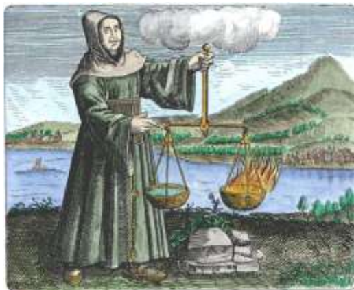
Figure 2 Thomas attends to the balance of elements: water and fire.