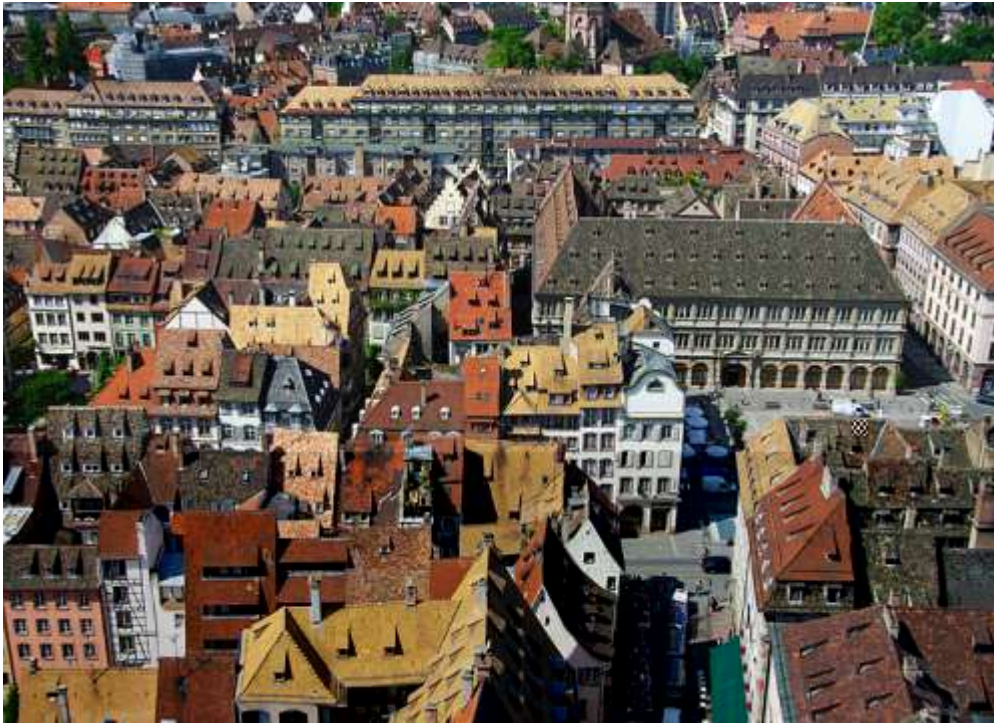
Figure 3 Strasbourg