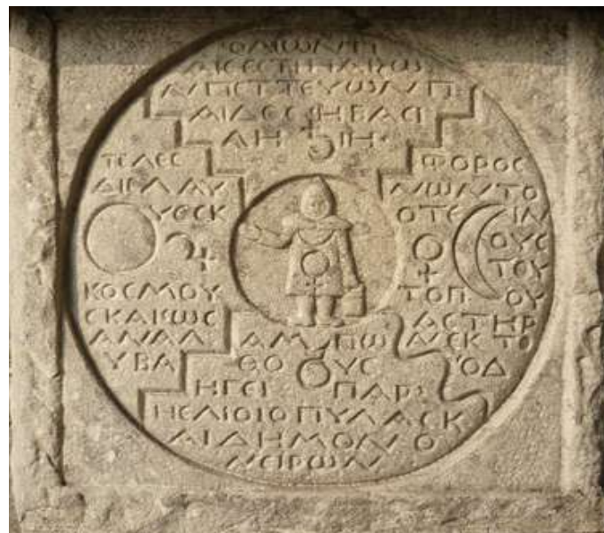
Figure 1 Main Face of the Bollingen Stone

The article that follows leads the reader into the world of fairy tales. Marie-Louise von Franz's unpublished (until now) interpretation of the Grimm fairy tale "The Goose Girl" opens with the fact that in this fairy tale two distant kingdoms co-exist. What does this mean in psychological terms? The problem of the shadow - particularly the shadow of the feminine - is discussed at length. Marie-Louise von Franz emphasizes several times that "The Goose Girl" is a special tale. Here, the old king does not mean, as he does in most other tales, an old and therefore in-need-of-renewal viewpoint. Rather, he stands for wisdom and careful insight. It is the old king who is responsible for the princess being where she should be at the end of the tale. Within the realm of feminine psychology, he is the equivalent of a sovereign spiritual-religious animus.