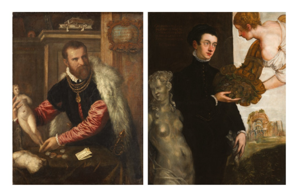
FiGURE 0.1 Tiziano Vecellio, Portrait of Jacopo Strada, Vienna, Kunsthistorisches Museum.

FiGURE 0.2 Jacopo Tintoretto, Portrait of Ottavio Strada da Rosberg, Amsterdam, Rijksmuseum.